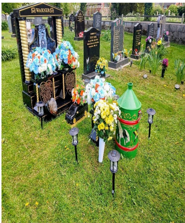
Grave on 27.4.26