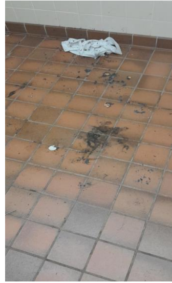
16.7.23 Fire inside toilet.