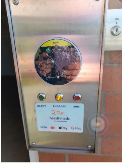
12.4.23 Glass smashed