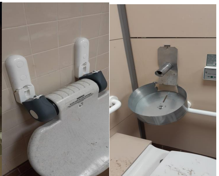
16.10.23 Baby change and toilet roll unit damage.