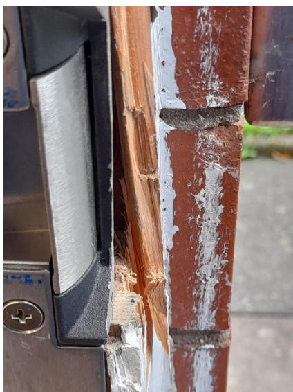
29.10.23 smashed frame

Agenda item 11a Recreation Ground Toilets report