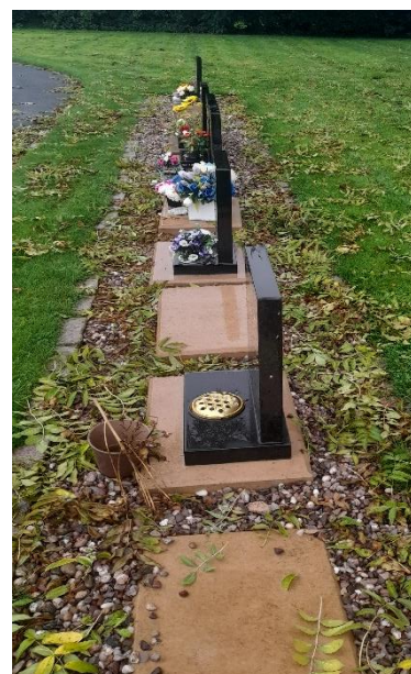
Type of headstone to be specified