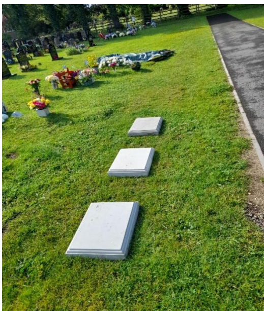
Foundation Stone spacing at Love Lane

Each foundation stone will be set at least 750 mm back from the path, with a minimum gap of 560mm between stones to allow mower access.